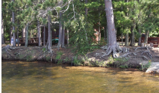
"Before" pictures of the Broken Arrow Condo Association shoreline in July 2016, showing the highly degraded/eroded shoreline, Photo by Gary Pulford..

Beginning in mid-February rock riprap was placed along 200 feet of the BACA shoreline. Then, in early May Envirolok bags were filled onsite with the soil/compost for the plants and placed in conjunction with the rock riprap. The bags are woven into an interlocking wall unit where native plants can develop extensive root systems that grow through the bag. The root structures grow many feet into the earth and lock the wall into place, providing a permanent erosion control system.