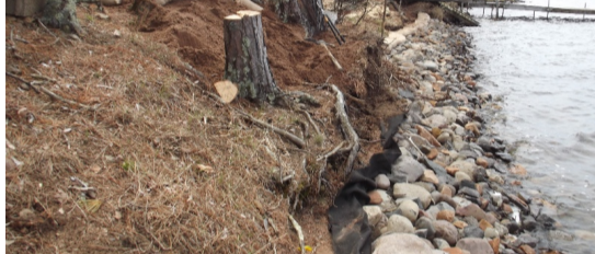
Installation of the rock rip rap and EnviroLok bag system in May 2017.

The shoreline was seriously damaged, after years and years of neglect, with the ultimate blow dealt in the July 2016 storm when many trees went down in straight line winds.